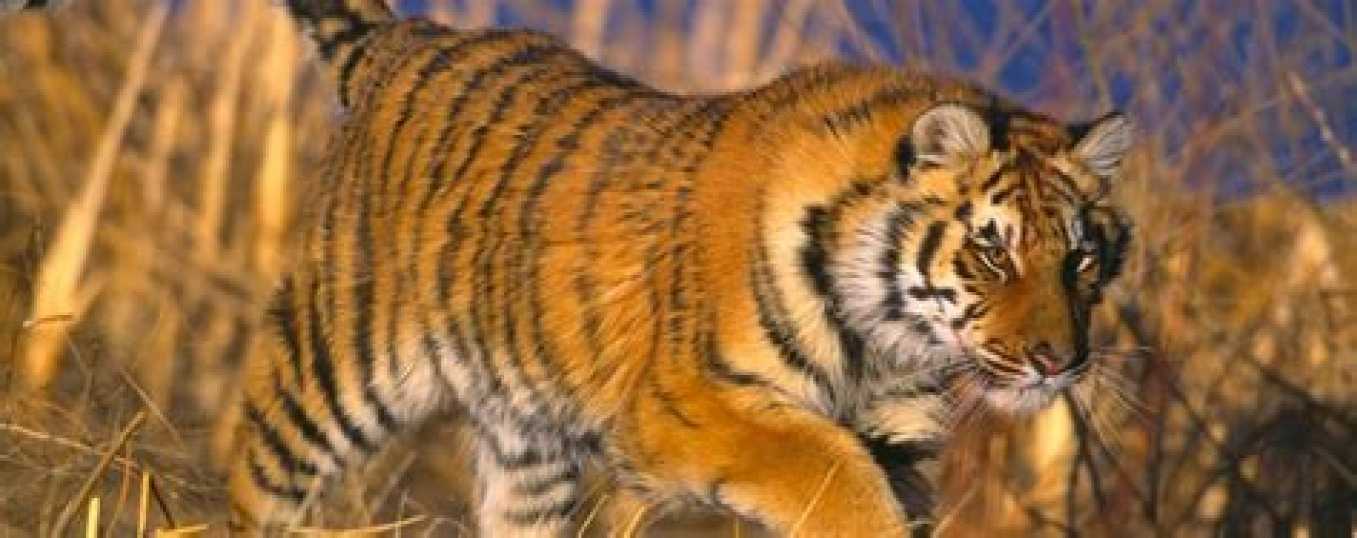
The rise of the asian tigers pdf. Who is the rising tiger of asia. How did the asian tigers develop. Why were the asian tigers so successful. The rise of the southeast asian tigers.